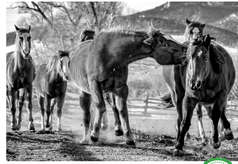
Rubbing is Racing Chuck Rasco