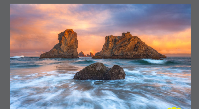
Bandon Sunrise Darren White