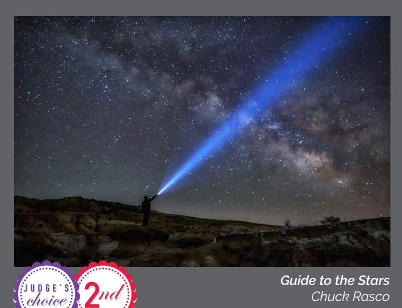
Guide to the Stars Chuck Rasco