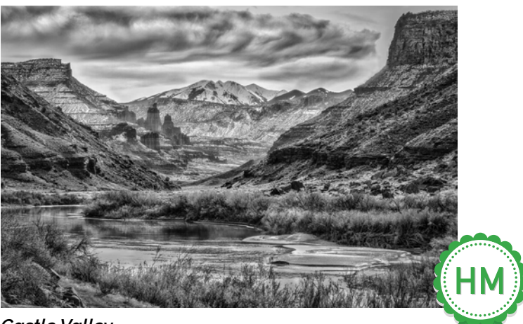
Castle Valley Tom Heywood